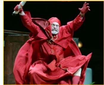
The Spanish Inquisition